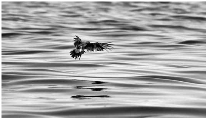
Figure 3. Storm petrel moulting wing feathers.