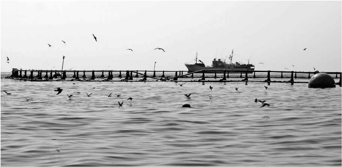
Figure 2. Some storm petrels around the tuna farm off the East coast of Malta.